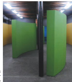
A section for exhibits and Town Model prior to completion

The Orientation Exhibits Gallery at the World Heritage Centre will be officially opened on June 27, 2006 by the Minister of Tourism & Transport, Dr. the Hon. Ewart Brown, JP, MP . This is a milestone event in the restoration of the World Heritage Centre.